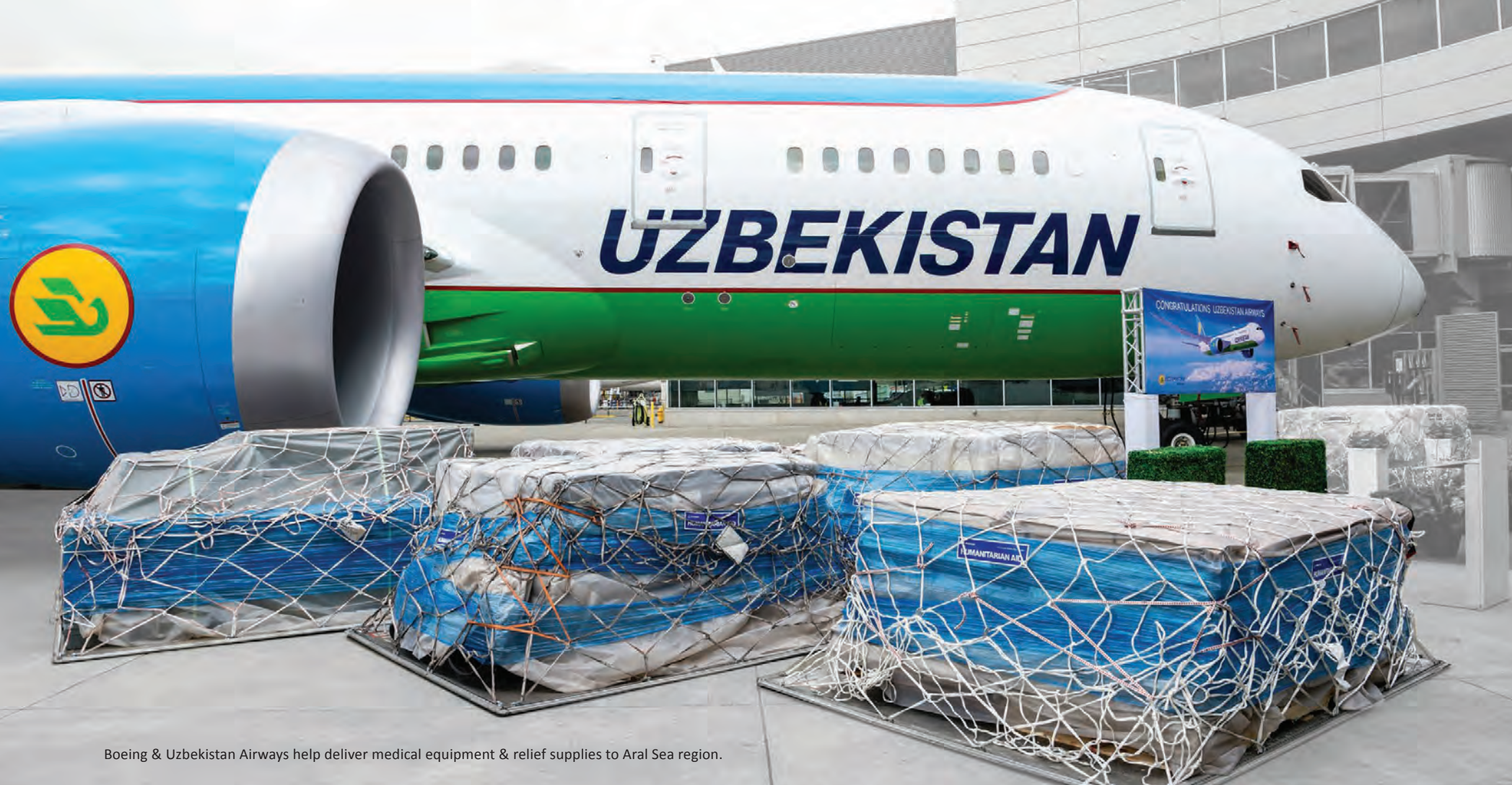
Boeing & Uzbekistan Airways help deliver medical equipment & relief supplies to Aral Sea region.