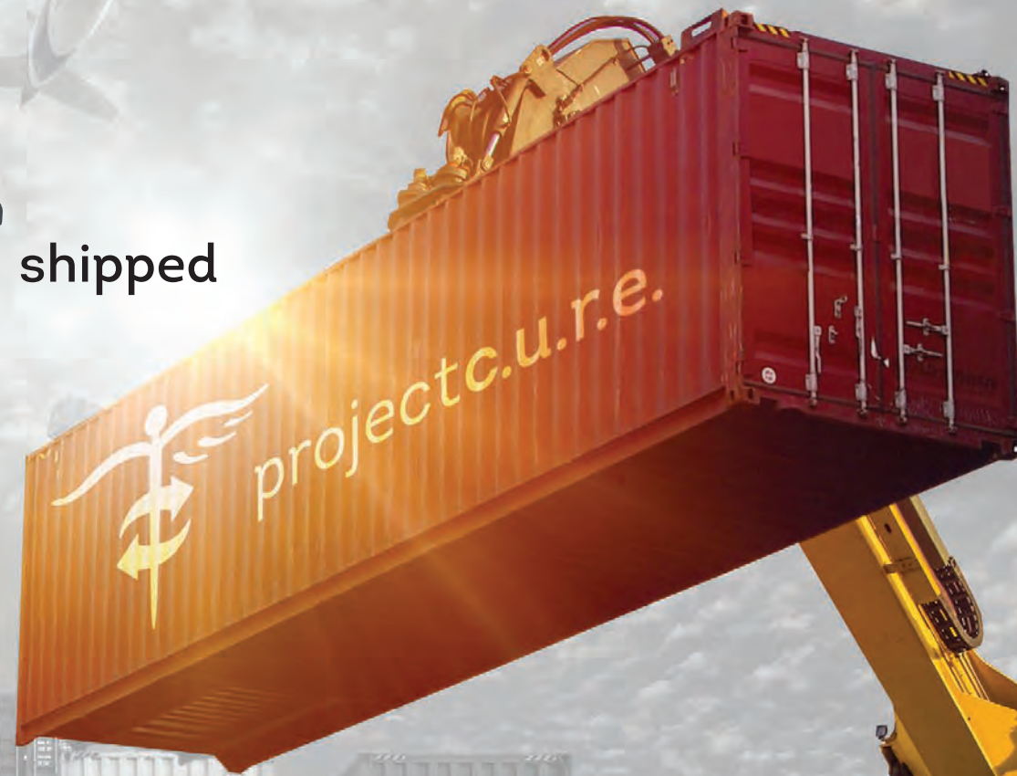
C.U.R.E. Cargo container ready to ship.