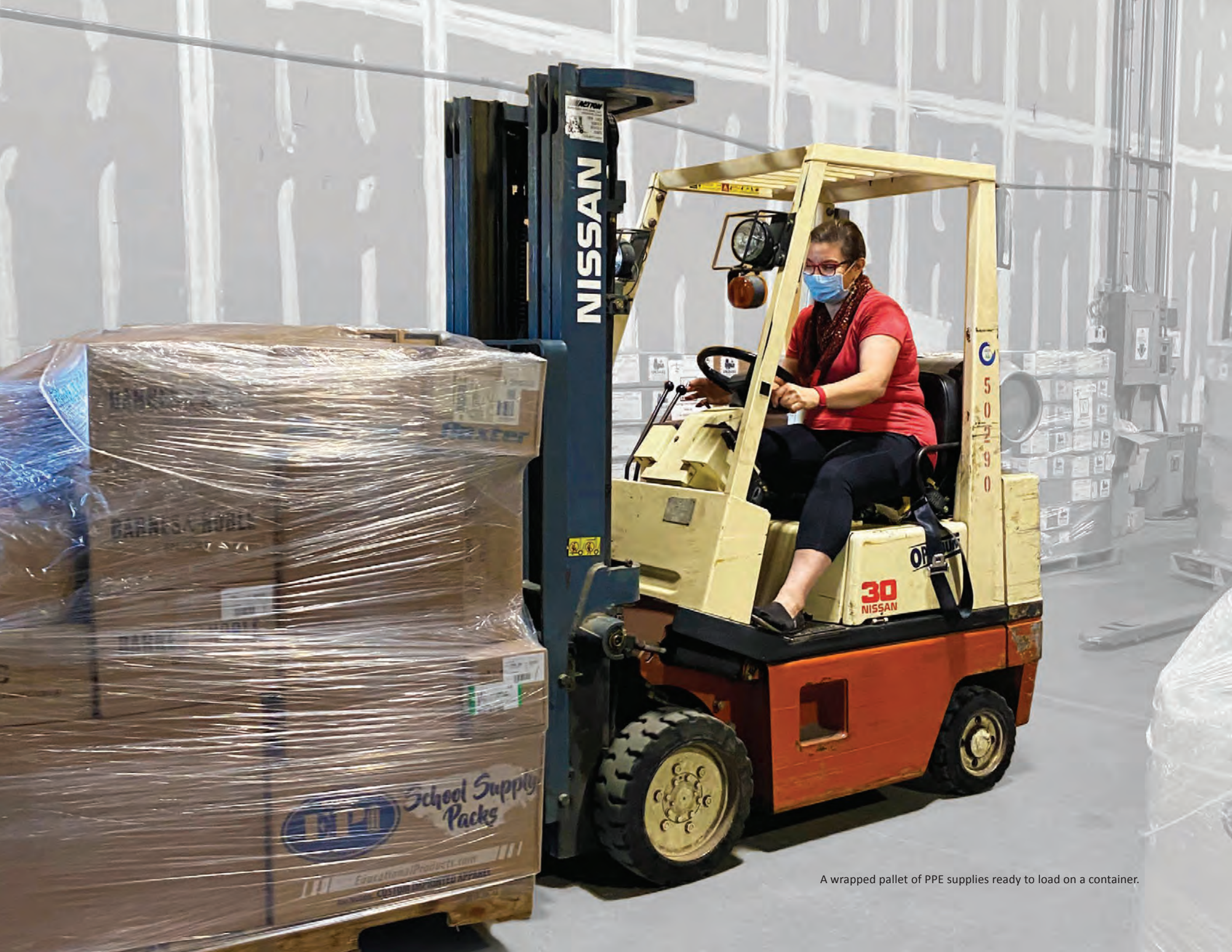
A wrapped pallet of PPE supplies ready to load on a container.