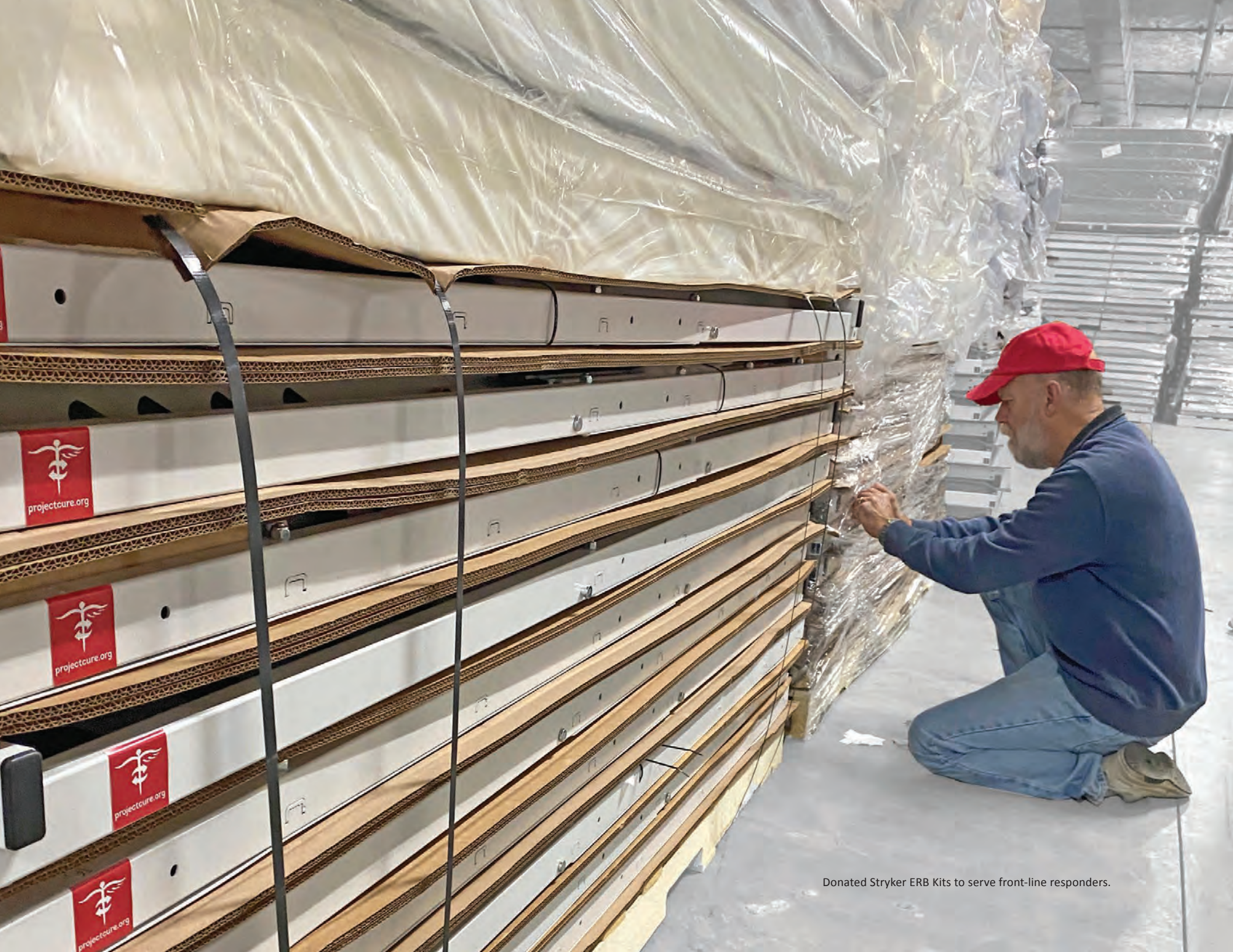
Donated Stryker ERB Kits to serve front-line responders.