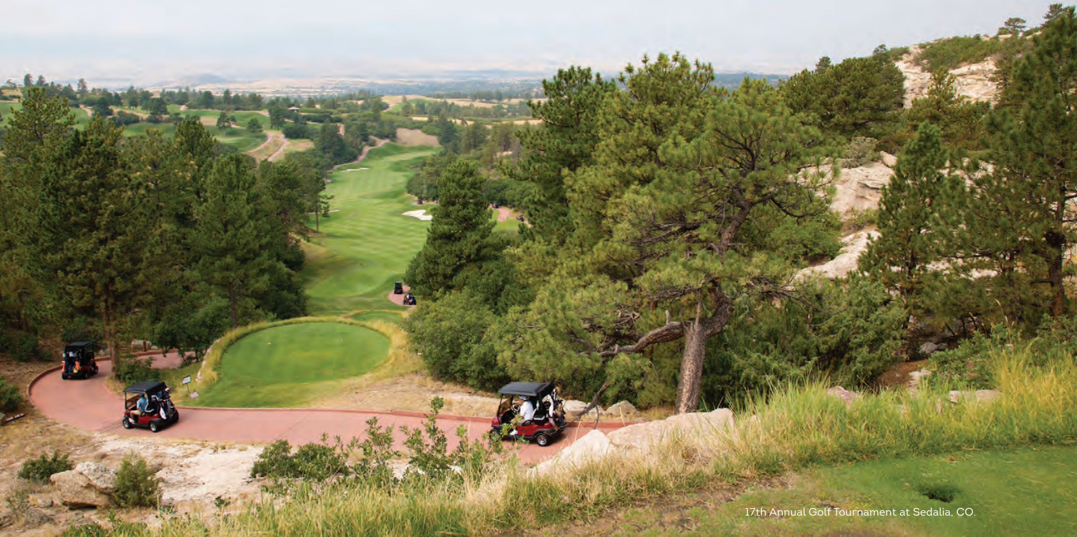
17th Annual Golf Tournament at Sedalia, CO.