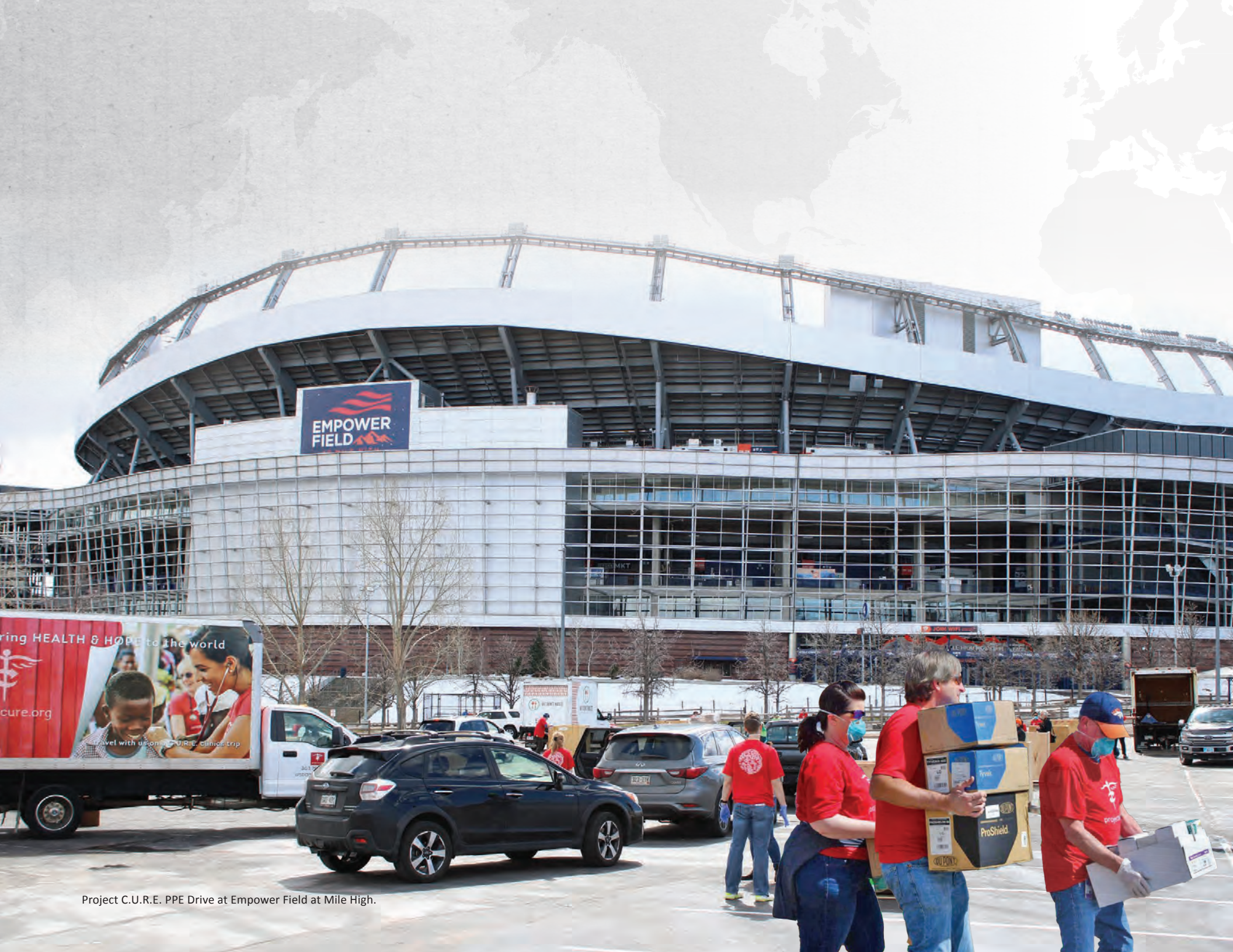
Project C.U.R.E. PPE Drive at Empower Field at Mile High.