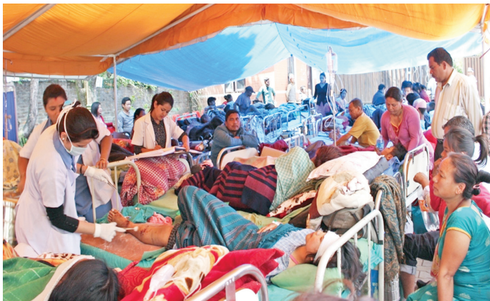
Outdoor hospital unit in Kathmandu.