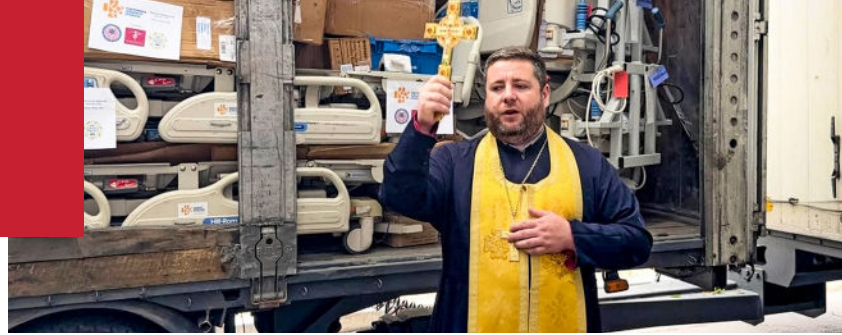
A priest blesses a truck full of donated medical beds before delivery to Support Hospitals in Ukraine.